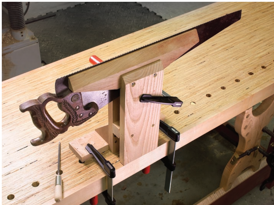
Hold it right there. Scrap wood and clamps, along with an hour or two of your time, provide you with the means to hold your saw steady and quiet while you sharpen.

A saw vise does two things: It puts the blade at a convenient height and the jaws keep the blade from vibrating as you file. Before you follow our plan, however, give some thought to