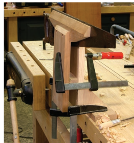
Three clamps. Two F-style clamps hold the vise to the bench, the third tightens the jaws. Keep the handle of the third clamp away from you.

The opposition believes that parallel jaws increase the mass in the wood-to-steel contact area, thereby reducing vibration. Changing from one to the other takes only a few minutes of planing, so try both ways and decide which works best for you.