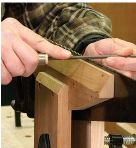
Tight fit. The jaws of the vise hold the sawblade and keep it from vibrating. If you hear an awful noise, the jaws need some work.